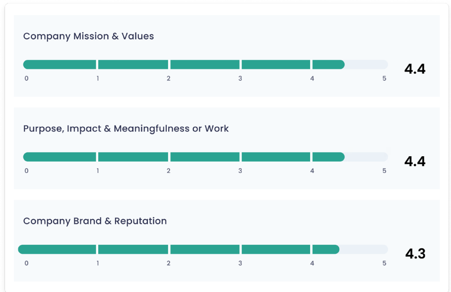
Medtronic Top 3 Booster