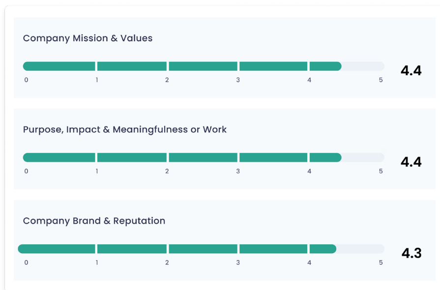
Medtronic Top 3 Booster